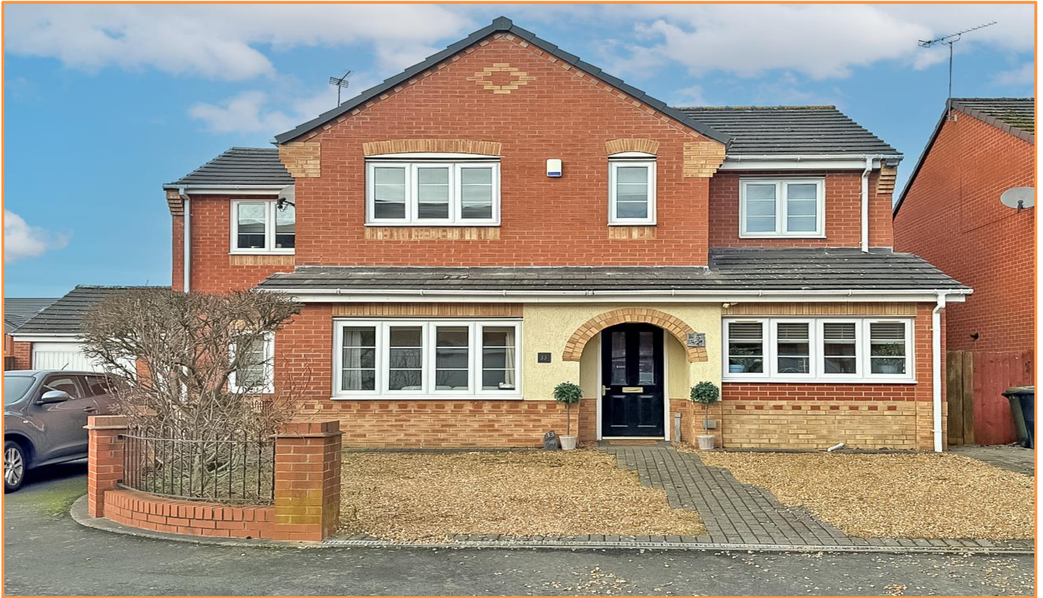
Smallshire Close, Wednesfield Wolverhampton, WV11 3SL